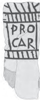
Right: Cramond 1971 car-park post-Roman altar Pro Car