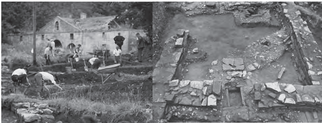
Above: Cramond 1954-66 Alan & Viola Rae Barrack Block B