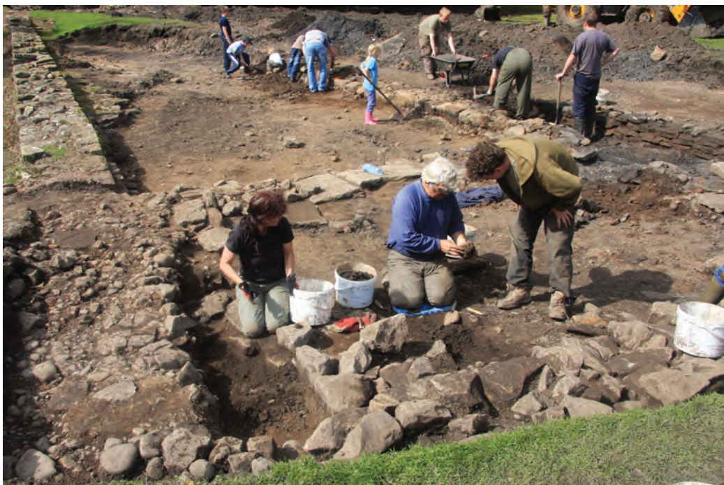
Cramond 2008 CEC Community dig