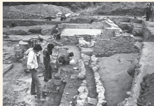
Cramond Bathhouse CEC excavations 1976