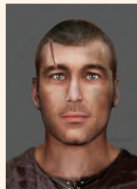
Cramond 6th century burial