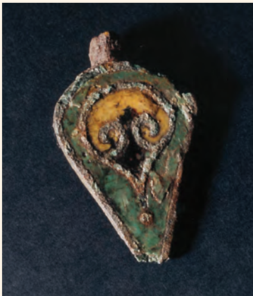
Cramond Roman enamelled seal-box

This conference will bring together professional and academic archaeologists, members of the public and those engaged in the management and interpretation of Cramond to explore these questions and many more. It is hoped that the conference will aid in the development of an Archaeological Research Agenda, building upon the 2003 CEC Historic Cramond Management Plan & SCARF, to encourage greater engagement, focus future research, innovation and aid in the management of the site.