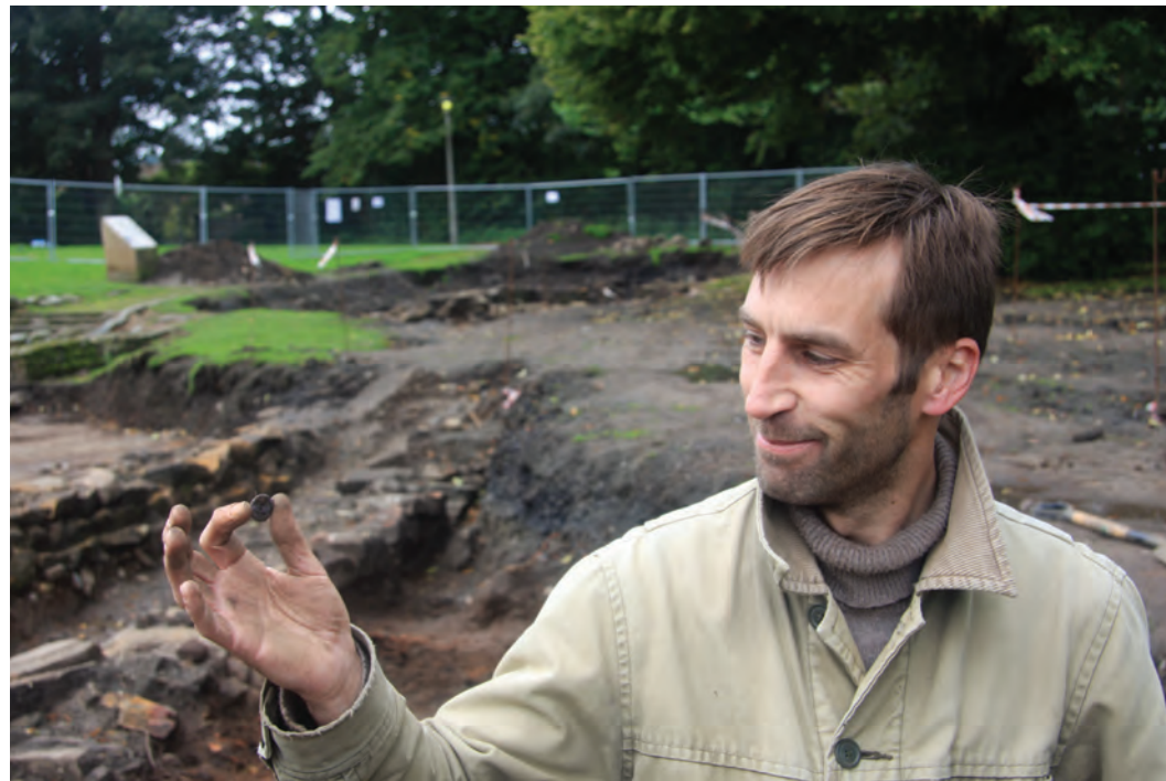
Cramond 2008 CEC Community dig